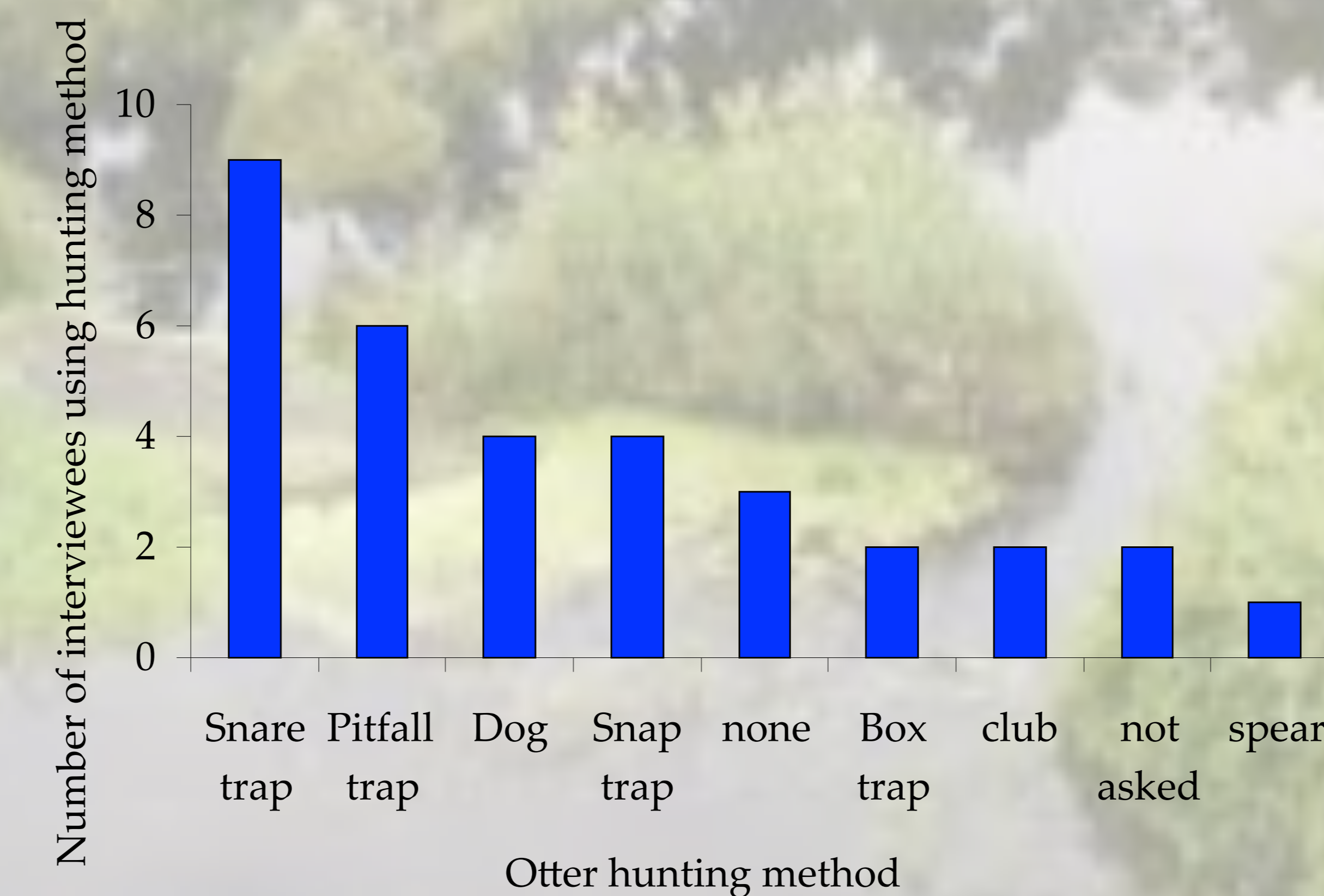
Figure 1. Reported methods of hunting otters, taken from interviews conducted in five villages surrounding U Minh Ha NP (n=20).

Twenty interviews were conducted, two possibly three species of otter were described by local hunters.